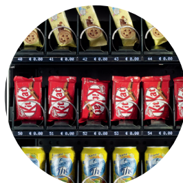
High visibility cell