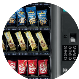
An elegant and uncluttered design